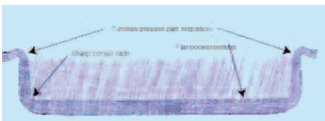
Image shown is actual "potted" sample photographed at 30x magnification.

Advantek Sharp Form Carrier Tape, or SFT™, was developed specifically for small form factor devices having precision packaging and confinement requirements. Razor sharp radii and near-vertical side-wall draft angles keep devices level and stable in the pocket, helping to prevent abrasion and reducing pick faults. Small form factor devices served by Advantek SFT™ include bare die, flip chips, CSP's, BGA's and bumped die.